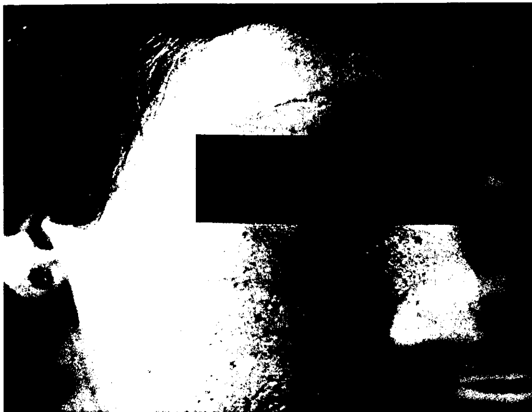
Figure 3. Right side of patient's face after treatment.

normal. Though she was still symptomatic she was released to return to work (light duty) as of June 20, 1983.