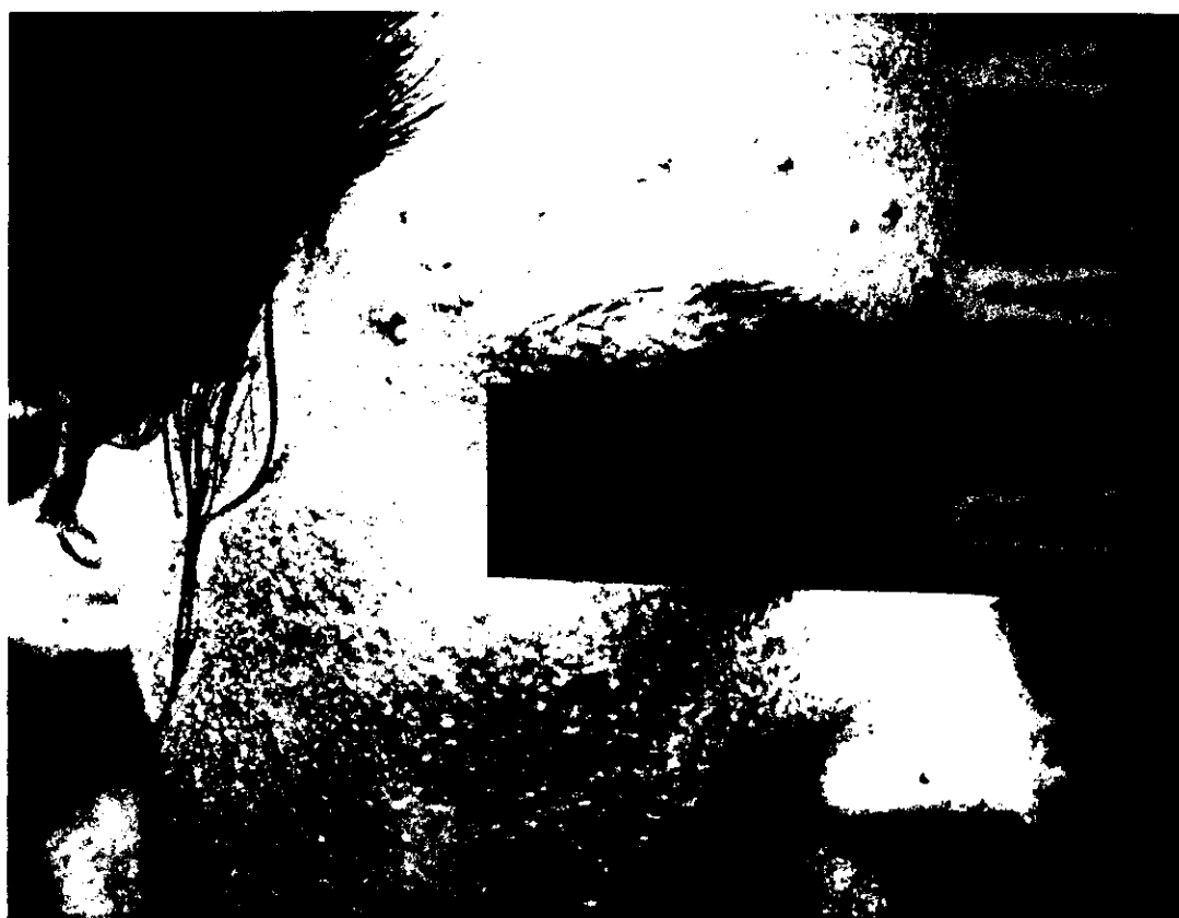
Figure 1. Right side of patient's face before treatment: Note the numerous pustular acne eruptions on the forehead and around the temple.

The initial medical examination performed in my office on April 13th, 1983, showed a slightly elevated temperature of 99.6^{\circ}\text{F} , pulse rate of 96, and a normal blood pressure